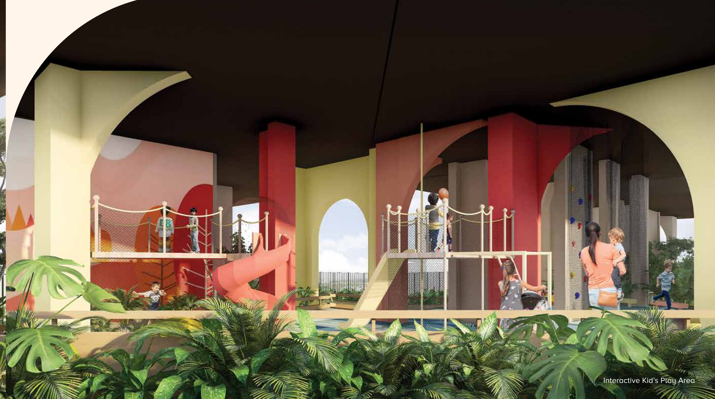
Interactive Kid's Play Area