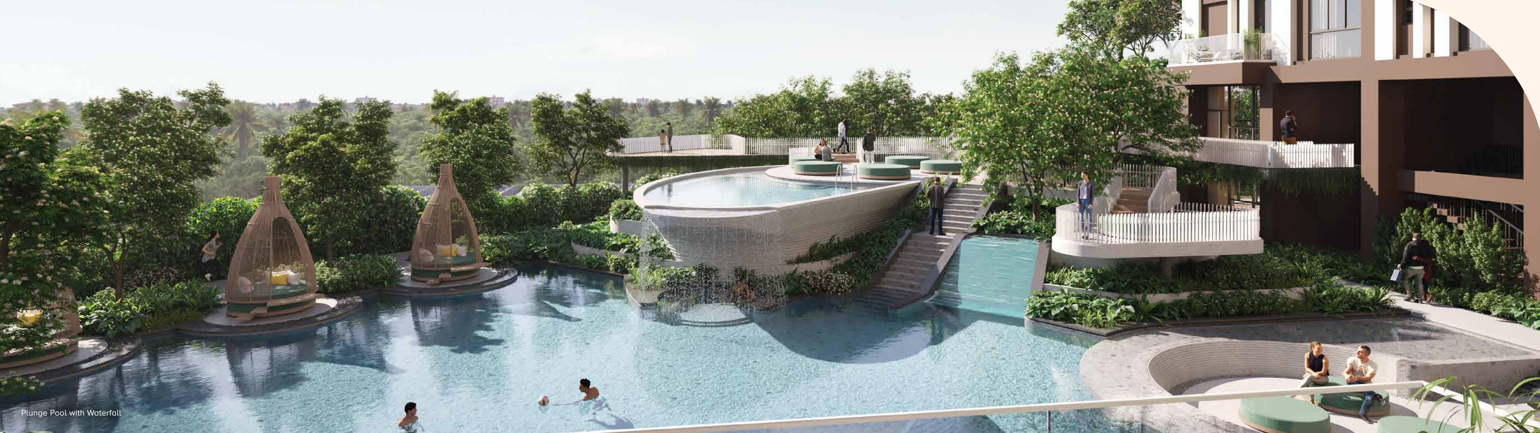
Plunge Pool with Waterfall