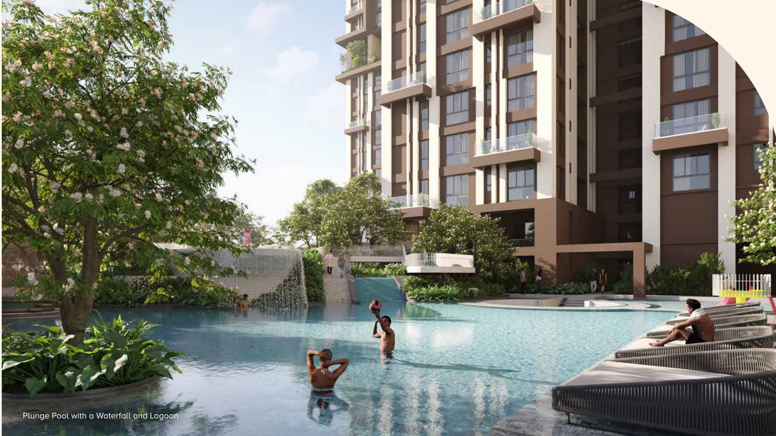
Plunge Pool with a Waterfall and Lagoon

Sanctum is a dream come true for those who love the water. That's because there are multi-level pools that cover an astonishing 8000 square feet. Lap pool, kids pool, jacuzzi, plunge pool with a waterfall and lagoon - the options just keep flowing. Add to that lazy, sunken seating and cabanas with sun beds and you've got vacation mode constantly on.