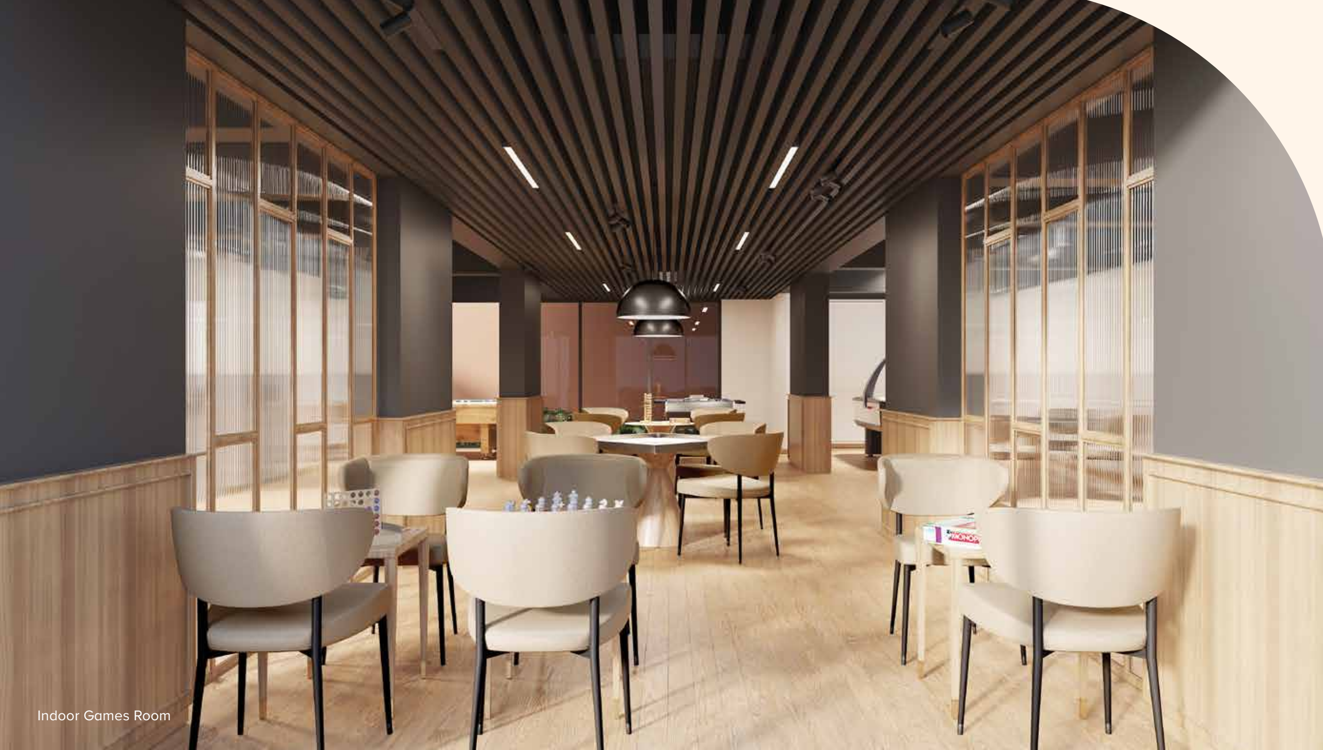
Indoor Games Room