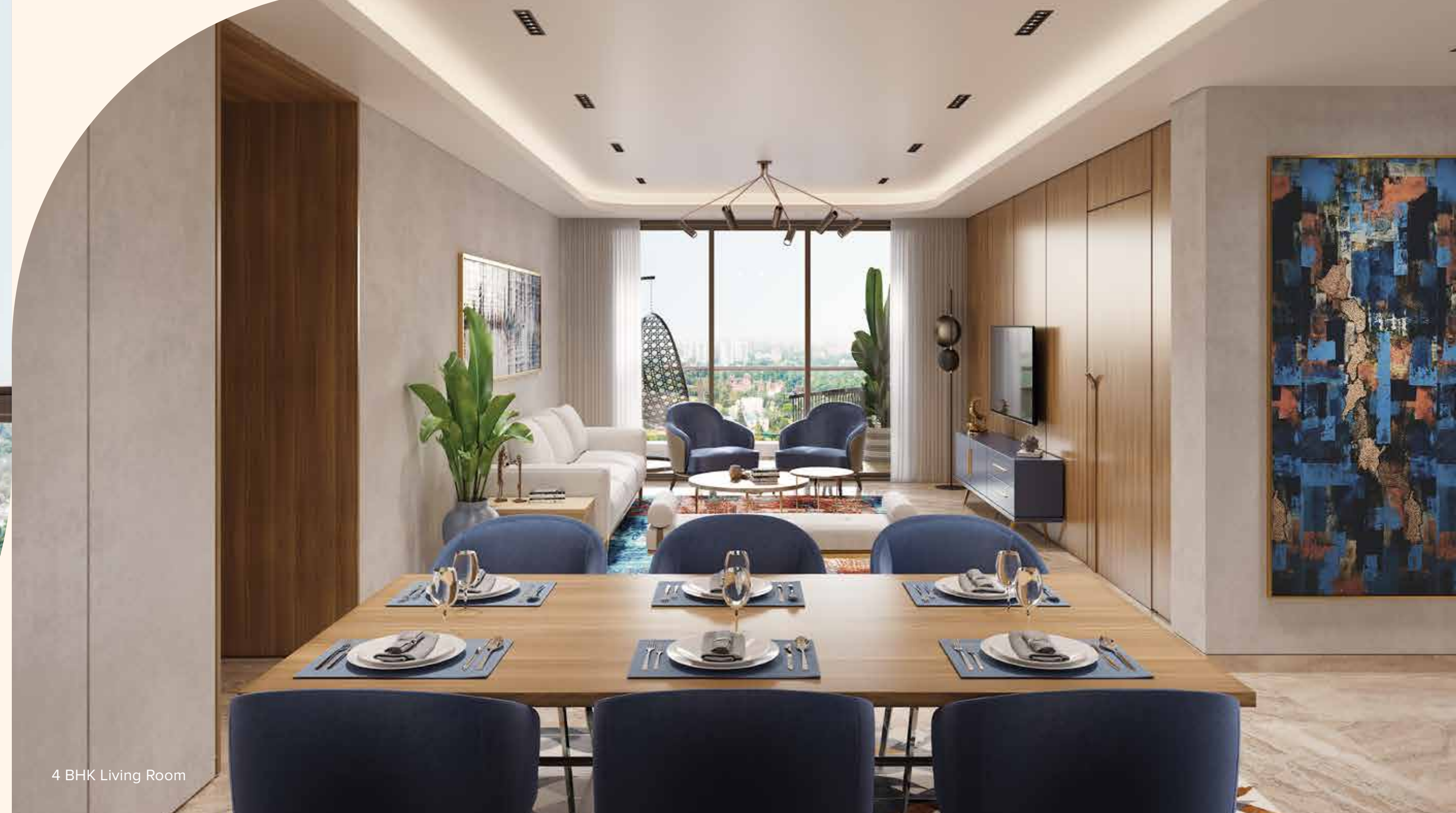
4 BHK Living Room