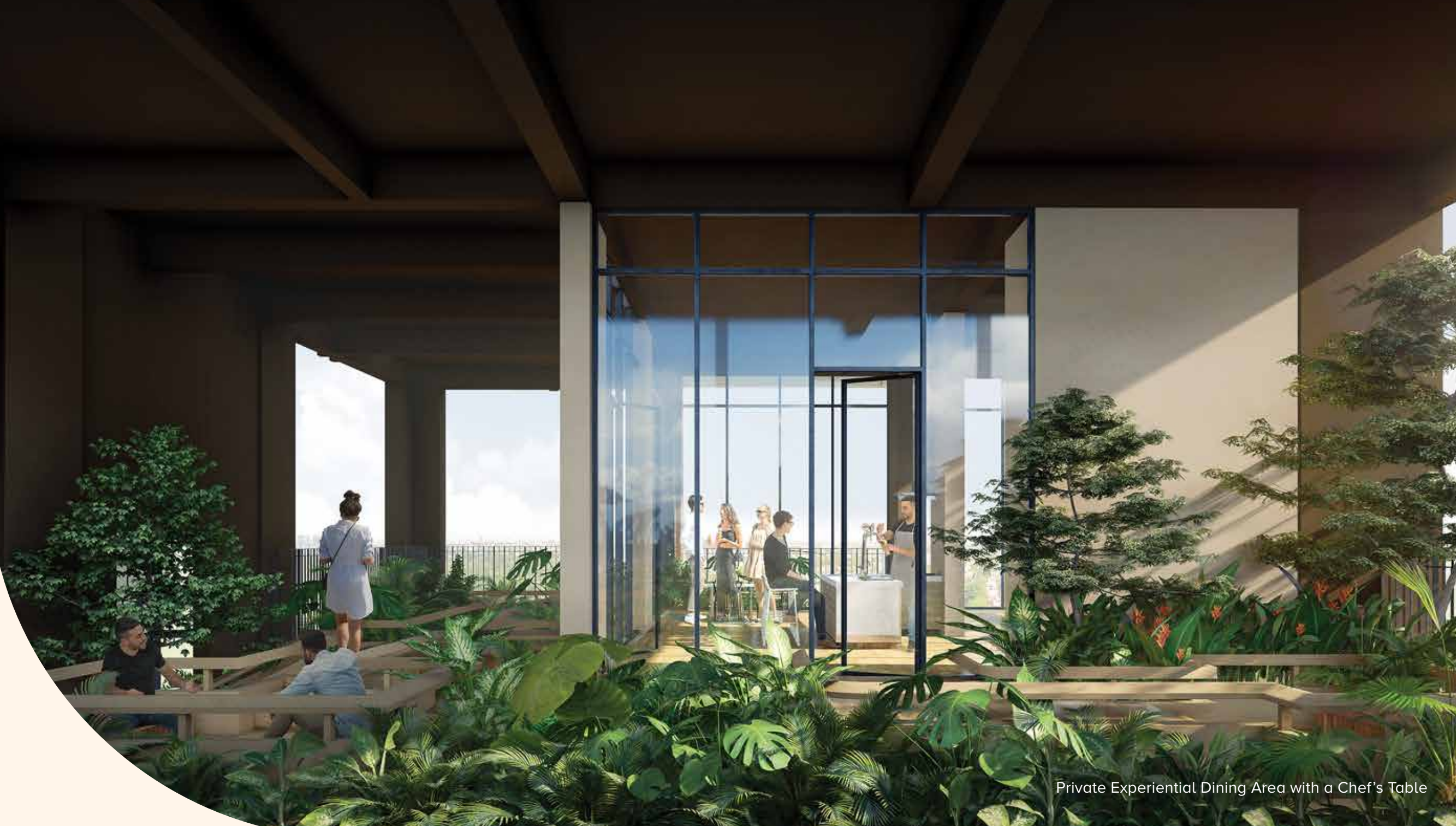
Private Experiential Dining Area with a Chef's Table