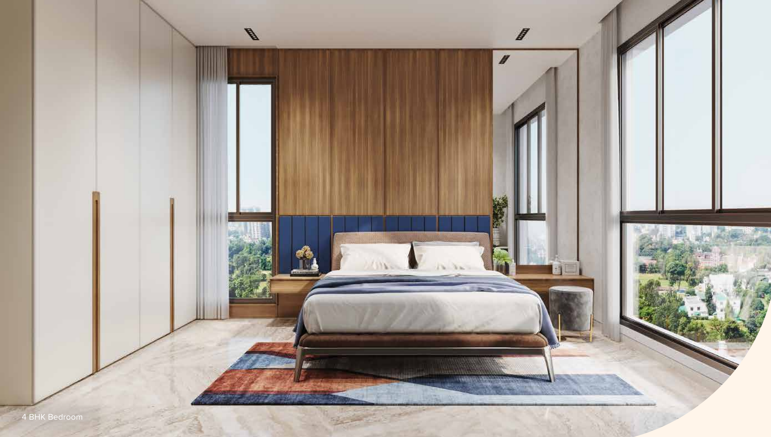
4 BHK Bedroom