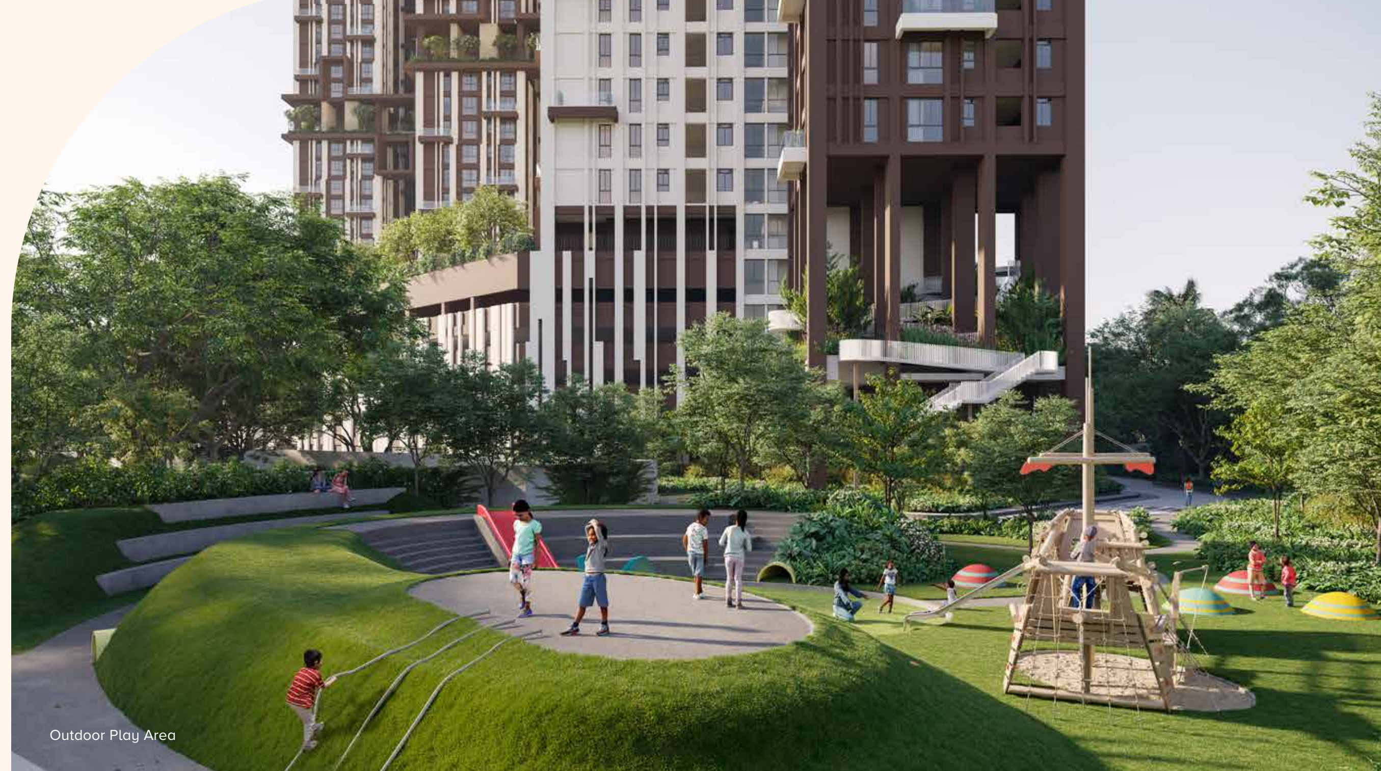
Outdoor Play Area