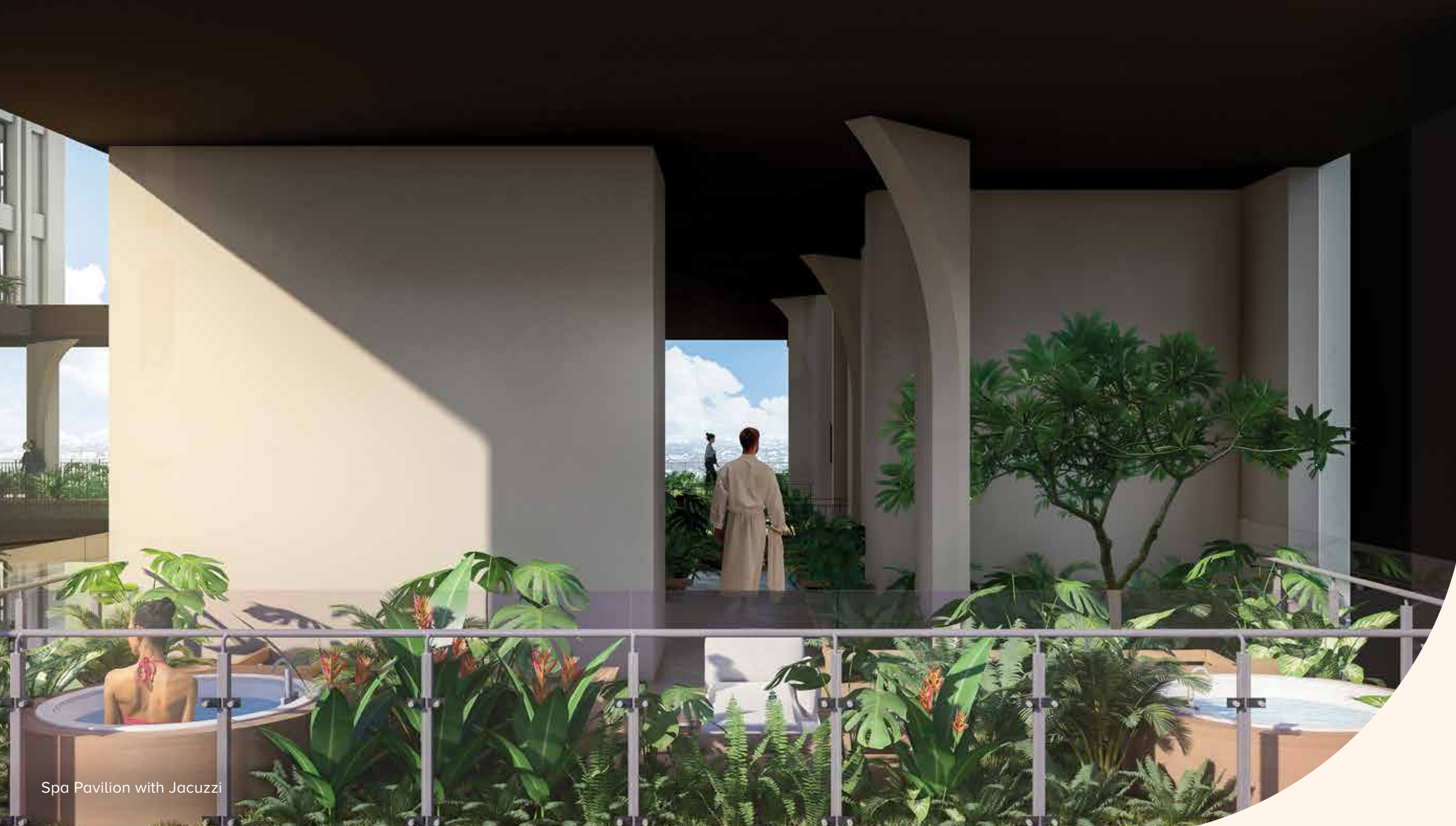
Spa Pavilion with Jacuzzi