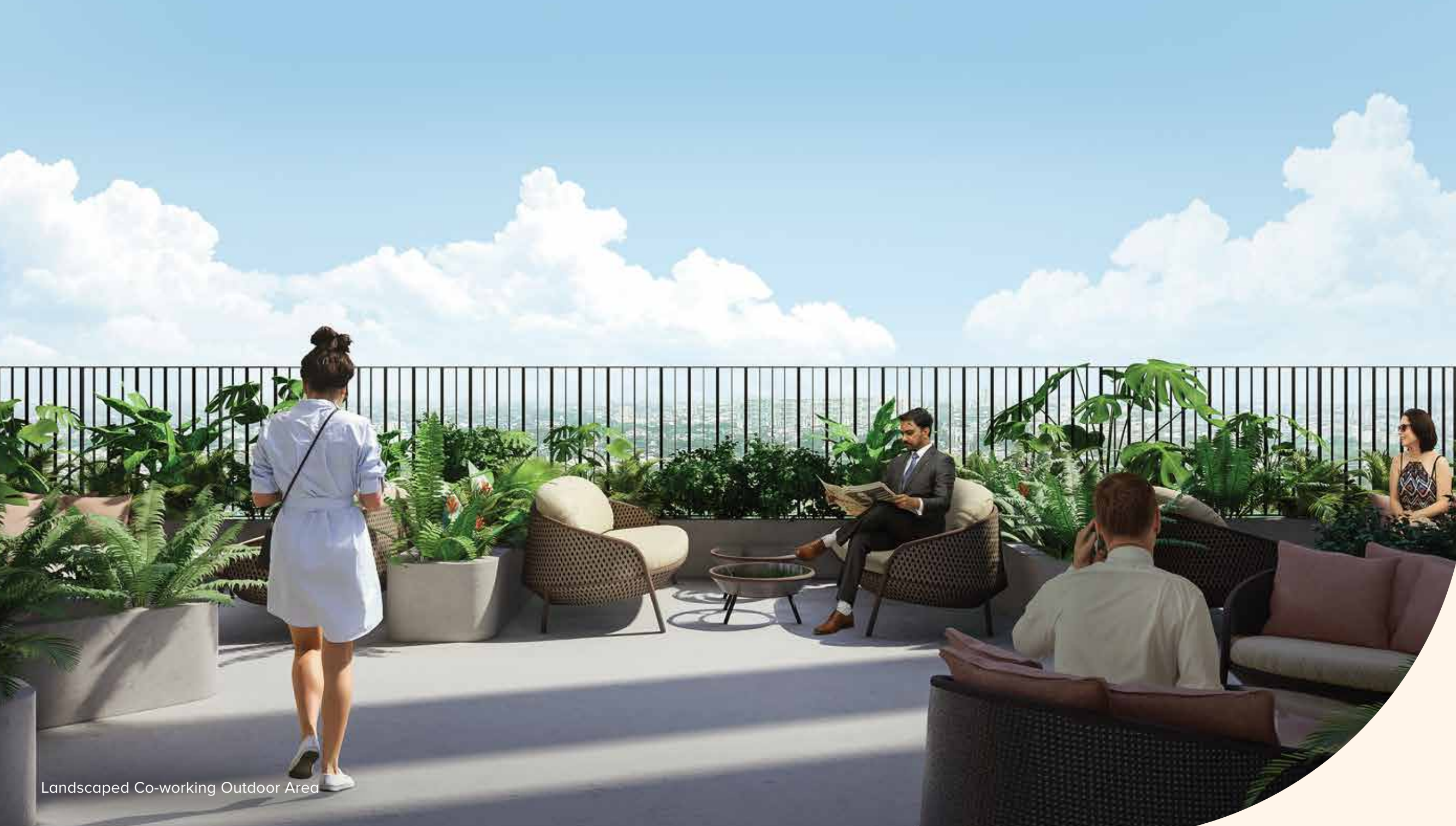
Landscaped Co-working Outdoor Area