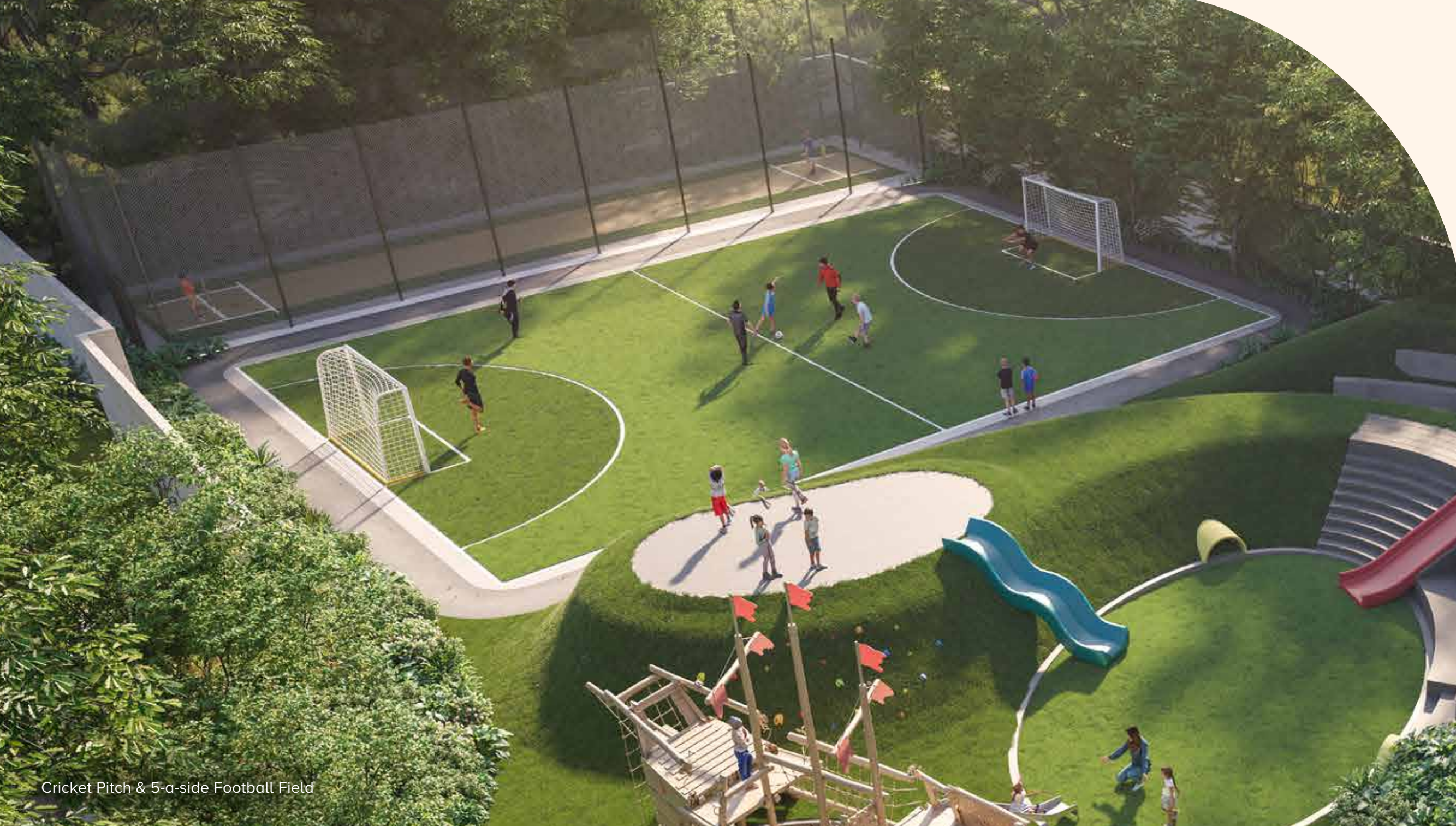
Cricket Pitch & 5-a-side Football Field