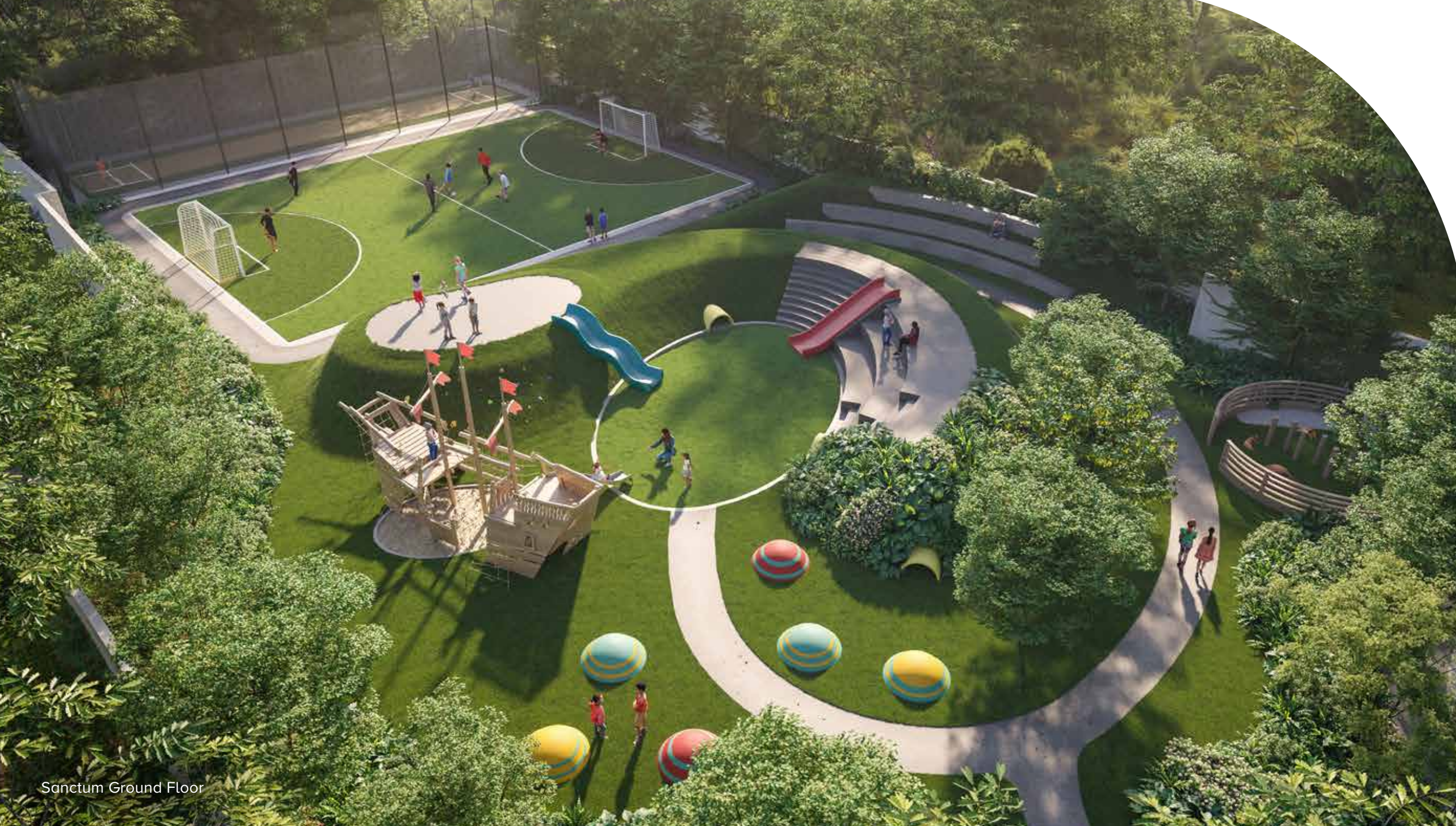
Sanctum Ground Floor