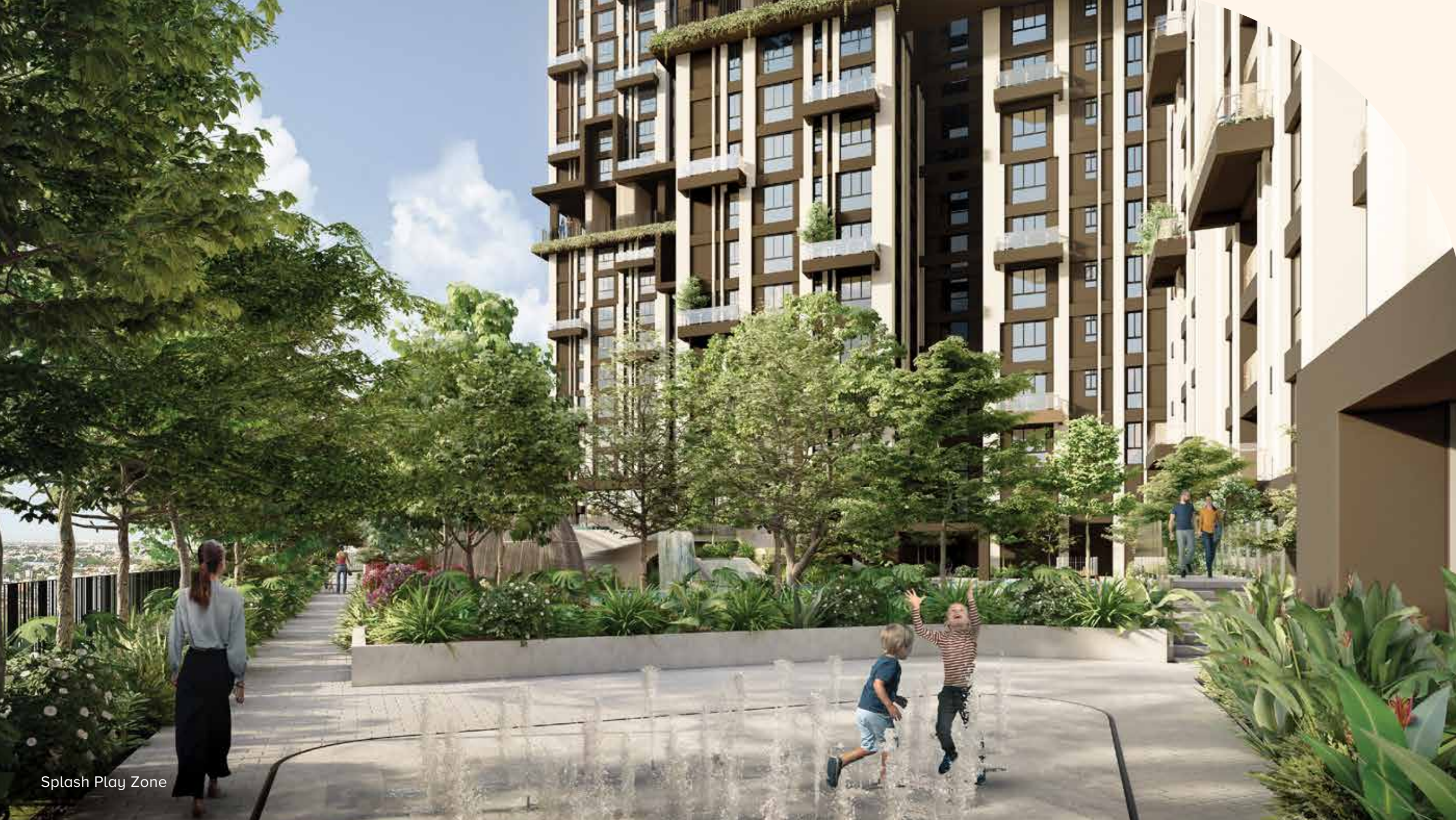
Splash Play Zone

There are amenities, and then there are amenities at Sanctuary. An endless list of sports, fitness, recreational and entertainment options for all ages. Honestly, there are so many things to choose from, we had to split them across 3 levels, the ground floor, the podium and the 16th floor level to accommodate them all.