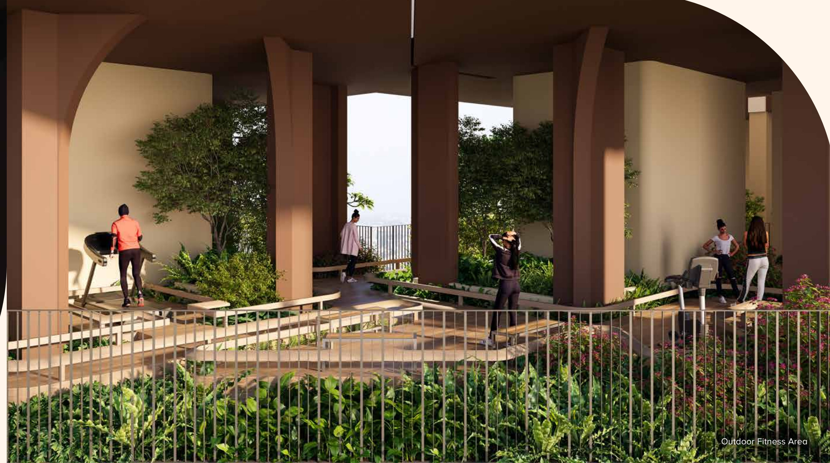
Outdoor Fitness Area