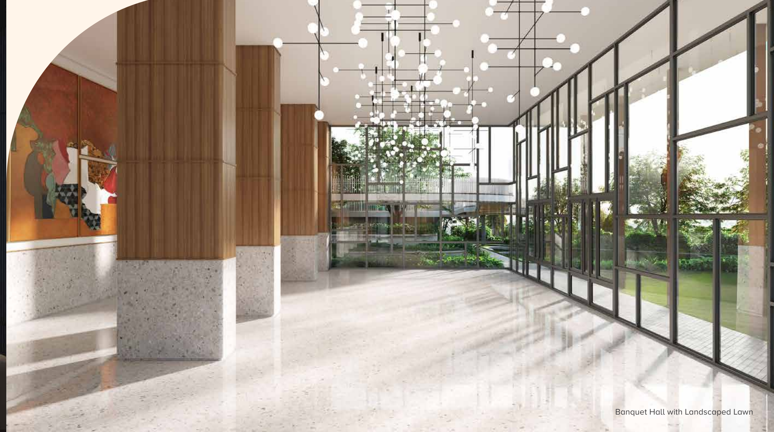
Banquet Hall with Landscaped Lawn